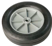
10" x 2 ¾" Wheel