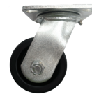
5" x 2" Swivel Caster (with Plate)