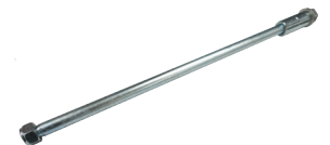
24-4/5" Replacement Axle